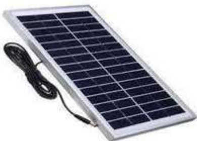
Fig: Solar Panel

The solar panel is having the short-circuit current of 5.8 Amp, the open-circuit voltage of 48.3 V and rated power at 445 Watt/m 2 solar radiation, all measured under STC. It has a dimension of 198.6 x 100.1 x 3.5 cm and weighs 22.5 Kilograms.