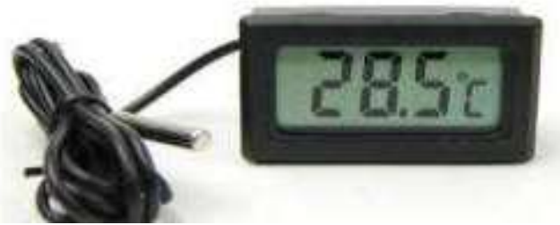
Fig: Temperature Sensor

This temperature sensor has a range of 0-150 C, accuracy \pm 0.1 C +NTC spread over 0 to 70 C. maximum resistance of 3 ohm and require 12v and 3.5 mAmp of power to operate.