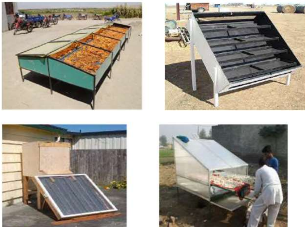
Fig: Different types of Solar Dryer