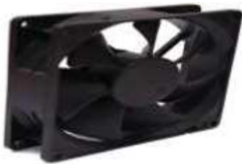
Fig: DC Fan

This temperature sensor has a range of 0-150 C, accuracy \pm 0.1 C +NTC spread over 0 to 70 C. maximum resistance of 3 ohm and require 12v and 3.5 mAmp of power to operate.