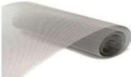
Fig: Wire Mesh

This Brushless DC Cooling Fan is operating at 12V with a dimension of 90 x 90 mm. It is very quiet and moves approximately at 65 CFM. It has a Dimensions of 90 x 90 x 25mm, Voltage of 12V, Speed of 2400RPM, Air flow of 65 CFM, Current of 0.10A, Cable Length:: 21cm, Sleeve type bearing.