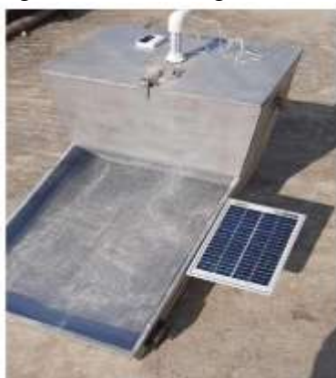
Fig: Actual Model